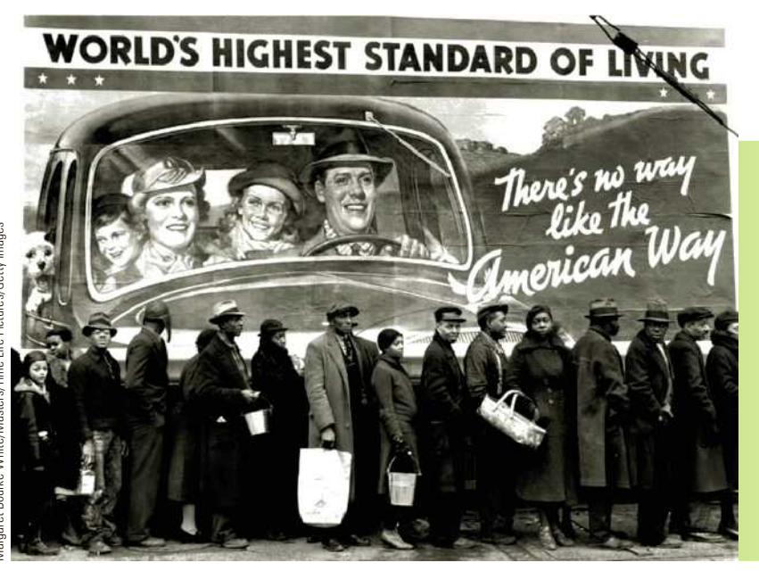
Figure 1.1 Ethnocentrism is the belief that one's own culture is superior to any other. This famous photograph, taken in 1937 by Margaret Bourke-White, draws attention to the contrast between the sentiment on the billboard and the people waiting in a bread line beneath. Note that the passengers in the car are white but all the people waiting for food are black.

Ethnocentrism (ethnocentric): Judging other cultures from the perspective of one's own culture. The notion that one's own culture is more beautiful, rational, and nearer to perfection than any other.